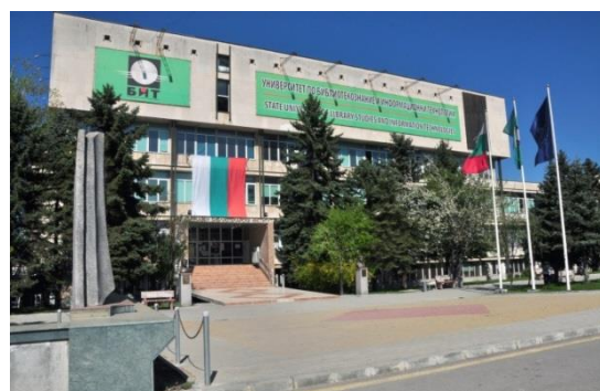
The Rectorate of SULSIT – Main Building

In SULSIT there are three departments in the field of Library and Information Sciences: Library Science Department, Library Management Department and Documental, Archival and Applied Heritage Department as structural units of Faculty of Library Science and Cultural Heritage with 35 employees and about 480 students.