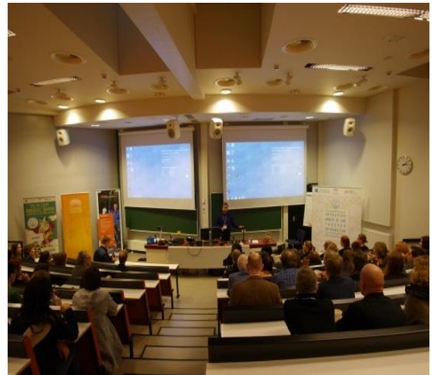
Session at Tampere BOBCATSSS, 2017.

thematic content aims to educate and draw attention to important theoretical and practical problems in the field of the library and information sciences and the library profession.